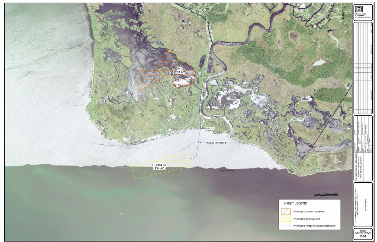
Figure I2:1-1. Project Location

The proposed marsh mitigation site (M-2) is located on the north shore of Lake Pontchartrain, east of the Causeway Bridge near Lacombe (Figures I1:1-1 and I1:1-2). The site is within the acquisition boundary of the Big Branch Marsh National Wildlife Refuge but is currently under private ownership. The site would provide 200 acres (47 AAHUs) of fresh and intermediate marsh habitat to compensate for unavoidable wetland impacts from the construction of the South and West Slidell levee and floodwall system under the St. Tammany Parish, Louisiana Feasibility study. Estimated footprint is 200 acres with a dike perimeter of 16,067 feet.